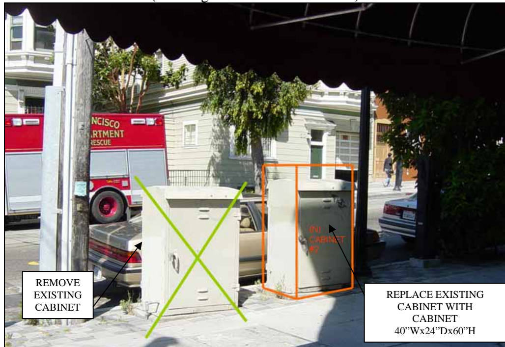
Fig 2 – Replace (E) Cabinet with new one at Northeast corner of Church and Duboce Intersection