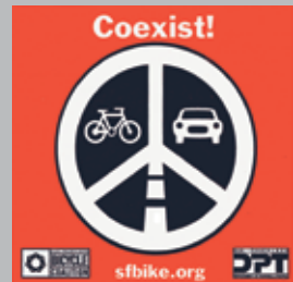
CoExist stickers for bumpers and bikes.