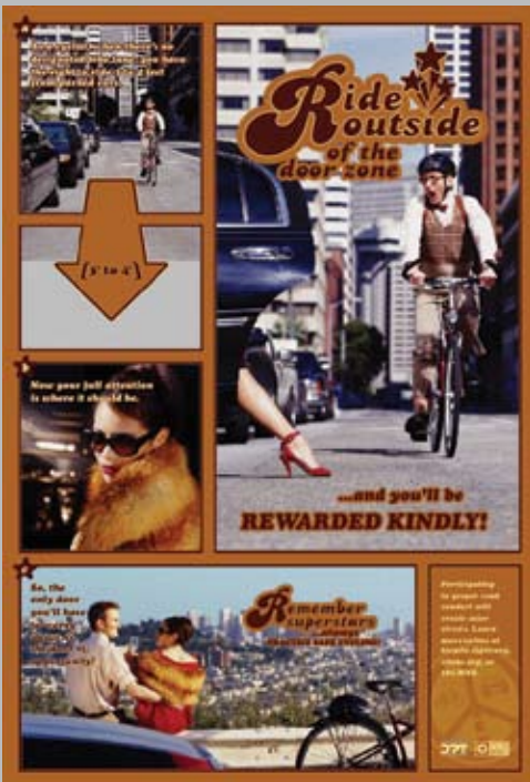
“Door Zone” CoExist poster.

A primary objective of the CoExist Campaign is to ensure that bicyclists will not ride in the “door zone,” where they are at risk of collision with the open doors of parked cars. Critical to this effort is alerting motorists that bicyclists have the right to share the traffic lane, and that motorists should pass bicycles safely, with caution and respect. For more information on CoExist, or to get CoExist stickers, go to www.bicycle.sfgov.org or www.sfbike.org .