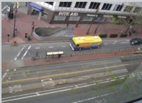
The BookMobile shares the dashed bike lane as it prepares to turn right.

Before merging left into traffic to make a left turn, or even to go straight through an intersection when a bike lane is dropped at an intersection, you should check over your left shoulder behind you for traffic.