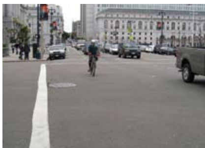
This cyclist is riding straight through this Polk Street intersection.