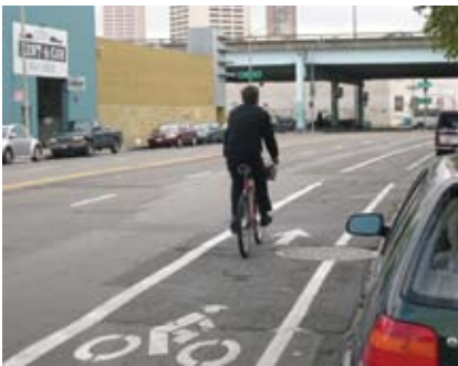
This bicyclist is out of the door zone, safely in the bike lane.

Some bike lanes may be close enough to parked cars, or cars may park so that their door reaches into the bike lane. You need to stay out of reach of opening car doors.