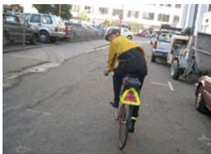
A shoulder check allows you to see traffic behind you.

When riding straight through intersections, do not fade to your right toward the curb and crosswalks as you approach intersections. These moves tell motorists that you are turning and they may anticipate a turn you do not make. Ride in a straight line from one bike lane to the one on the other side of the intersection.