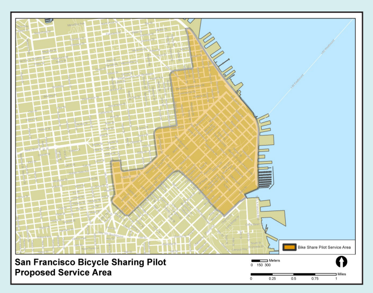
City of San Francisco Bicycle Share Pilot Service Area

known to be positively correlated with bike sharing success in a raster-based GIS overlay analysis.