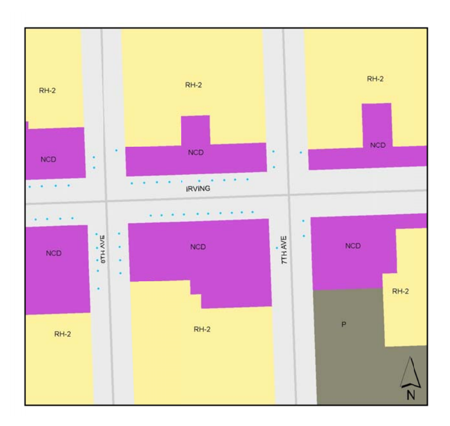
Figure 1. Parking meters on Irving Street between 7<sup>th</sup> Avenue and 8<sup>th</sup> Avenue round the corners from the commercial district onto the adjacent residential blocks along commercial parcels.

Note: Points on the maps below represent approximate meter locations. Continuous metering of appropriate areas is subject to varying street conditions (e.g., Muni stops, disabled parking spaces and other colored curb regulations, driveways, bulbouts, parklets, etc.).