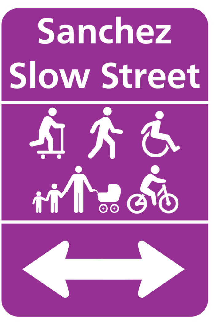
Street Signs for Cross Street Intersections