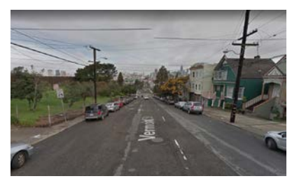
Existing view of Vermont St looking north toward 17<sup>th</sup> St, with a view of where the proposed angled parking will begin near the greenspace on the left. The greenspace is under the jurisdiction of Caltrans.