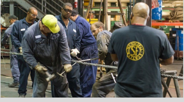
Wire Rope Cable Maintenance (with Local 39)