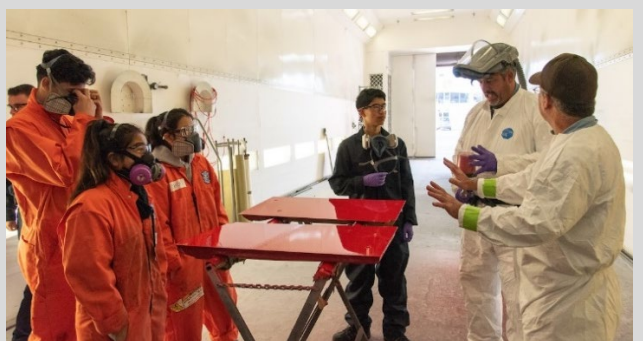
Auto Painter and Autobody/Fender (with Local 1414)

If the Board approves this investment, we expect to have six-to-seven training programs and approximately 45-50 apprentices by the end of the two-year program.