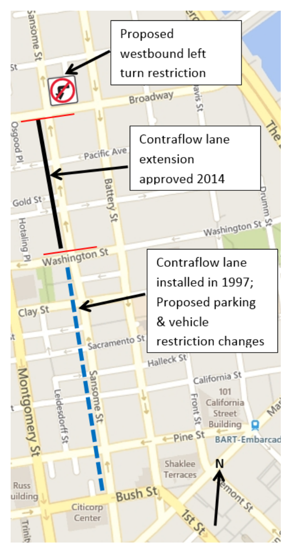
Figure 1: Overview Sansome Street southbound contraflow lane

This legislation will modify the 1997 segment of Sansome Street contraflow lane between Washington and Bush streets to allow for overnight parking and to allow bicycles, which will make the entire Sansome corridor between Broadway and Bush Street consistent when the extension completes construction this fall. This is depicted in Figure 1.