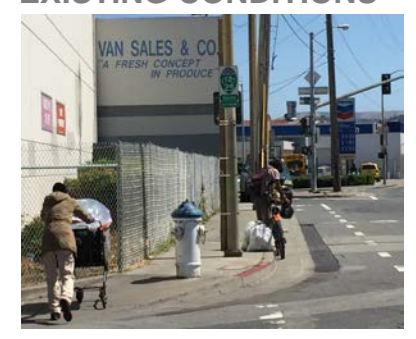
Narrow shared sidewalk for bicyclists and pedestrians on Bayshore Boulevard near Marin Street.