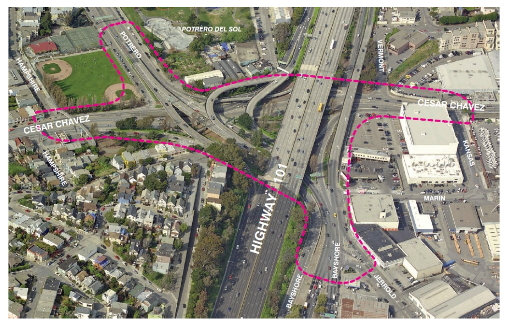
Cesar Chavez Street, Bayshore Boulevard and Potrero Avenue (The Hairball) Project Area

The Hairball Intersection Improvement Project is an effort to make key portions of the Hairball paths safer and easier to use for pedestrians and bicyclists. The project builds on previous planning efforts including the Cesar Chavez East Design Plan and aims to support citywide efforts such as WalkFirst, Vision Zero, and the SFMTA 2012 Bicycle Strategy to improve non-motorized safety and mobility in San Francisco.