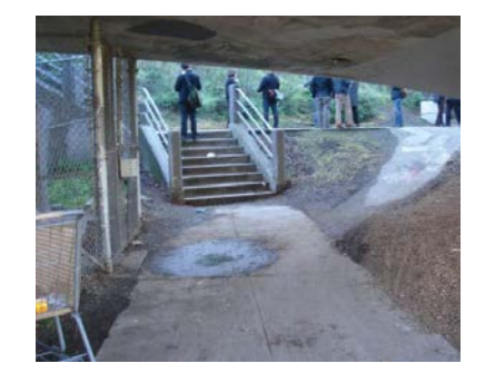
Low clearance for bicyclists traveling on the path at the southwestern entrance to the Hairball