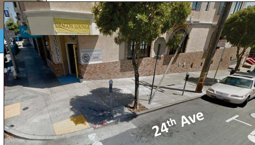
Manage nearest spaces on side streets to encourage turnover