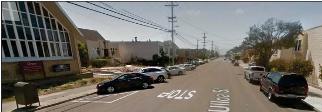
Add angled parking on side streets