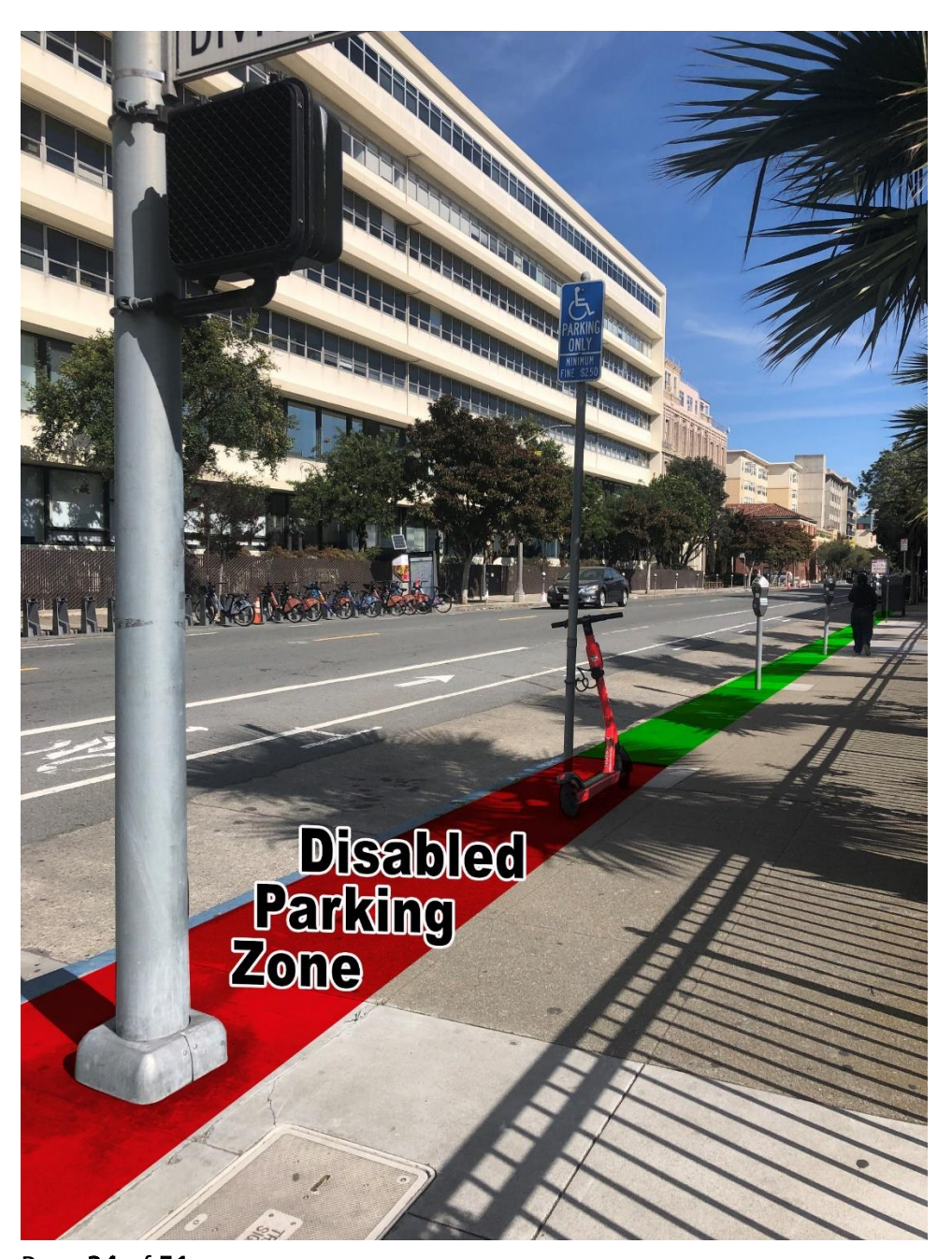
Page 24 of 51