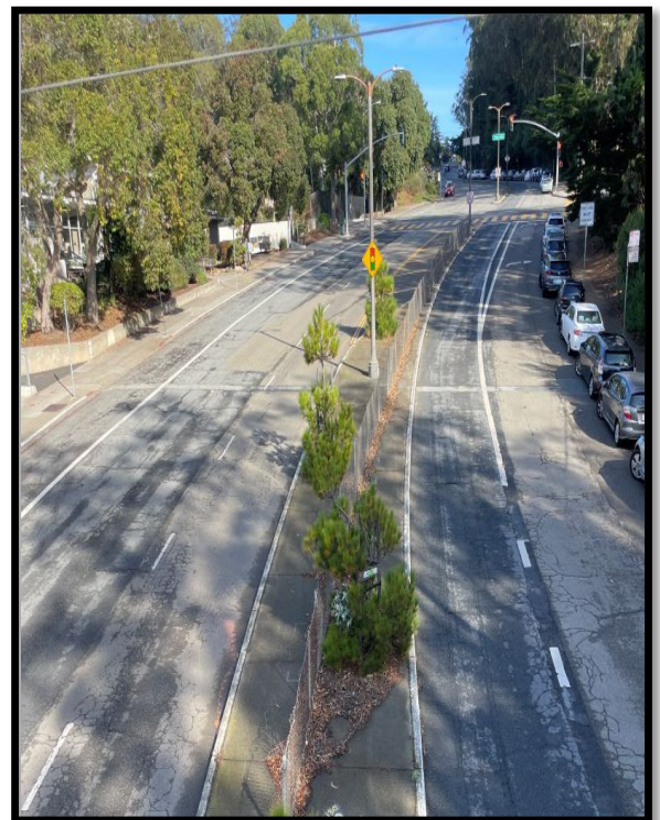
Figure 2 Clarendon aerial view looking Northeast towards Panorama Drive