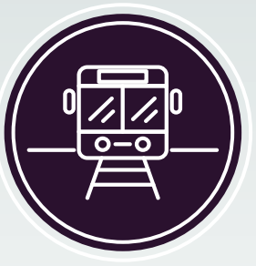
Bus bulbs or transit-related signal improvements