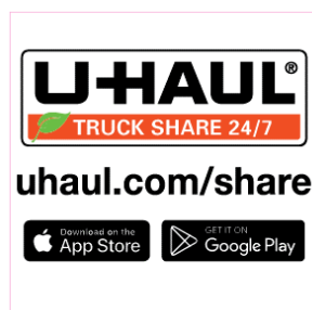
Figure 4: U-Haul Truck Share emblem