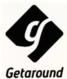
Figure 3: Getaround emblem