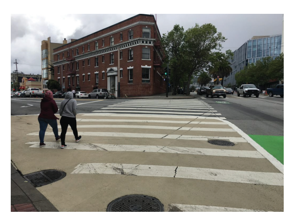
Existing "painted safety zones," like this one at Guerrero and Market streets, will be converted to wider sidewalks and shorter, more accessible pedestrian crossings starting later this year.

【 311 Free language assistance / 免費語言協助 / Ayuda gratis con el idioma / Бесплатная помощь переводчиков / Тrợ giúp Thông dịch Miễn phí / Assistance linguistique gratuite / 無料の言語支援 / Libreng tulong para sa wikang Filipino / 무료 언어 지원 / การช่วยเหลือทางด้านภาษาโดยไม่เสียค่าใช้จ่าย / خط المساعدة المجاني على الرقم /