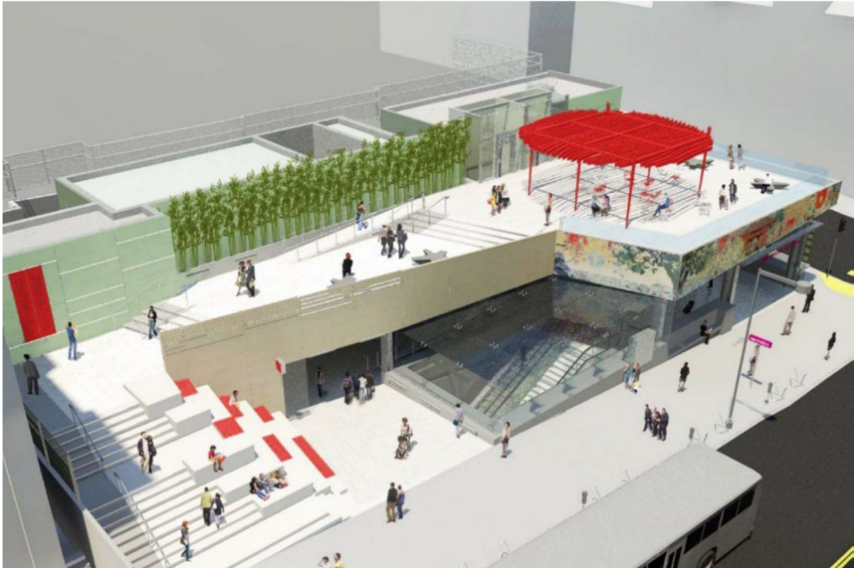
Rooftop Level of Chinatown-Rose Pak Station