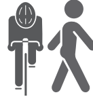
Bicycle-Pedestrian Interactions (Between Transit Boarding Island, Bikeway and Sidewalk)

On average, the bike signal compliance rate was 63%, meaning almost 2/3s of bicyclists did not comply with intersection signals (citywide average \geq 85\% ). However, conflicts with pedestrians due to noncompliance were low and the person bicycling yielded to the pedestrian 75% of the time.