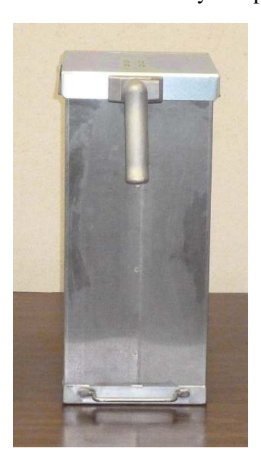
Figure A-4: Cashbox

(1) To store revenues securely, each Farebox shall contain a Cashbox as shown in Figure A-4. All U.S. coins and bills shall be deposited into a single Cashbox, securely compartmentalized to separate the coins from the bills.