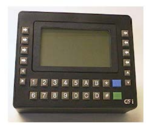
Figure A-2: Operator Control Unit

The OCU dimensions shall be no greater than 8 inches by 7 inches by 3 inches.