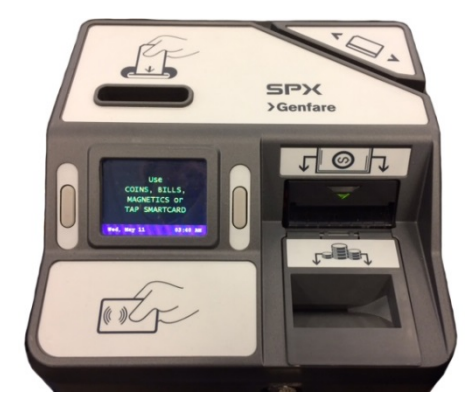
Figure A-1: Odyssey Farebox with color passenger display

The Contractor shall install its Odyssey model Farebox on all Muni trolley coach, motor coach, light rail vehicles and most historic streetcars. Historic streetcars with antique fareboxes and cable cars are not included in this procurement. As shown in Figure A.1, the Odyssey Farebox will include a color passenger display, slots for coin and bill currency, a transfer/fare receipt dispenser and a transfer/fare receipt reader.