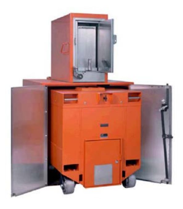
Figure A-5: Revenue Transfer and Collection System Components, including a Cashbox Receiver (top), Mobile Bin (bottom, on wheels) and Vault Housing (container with doors)