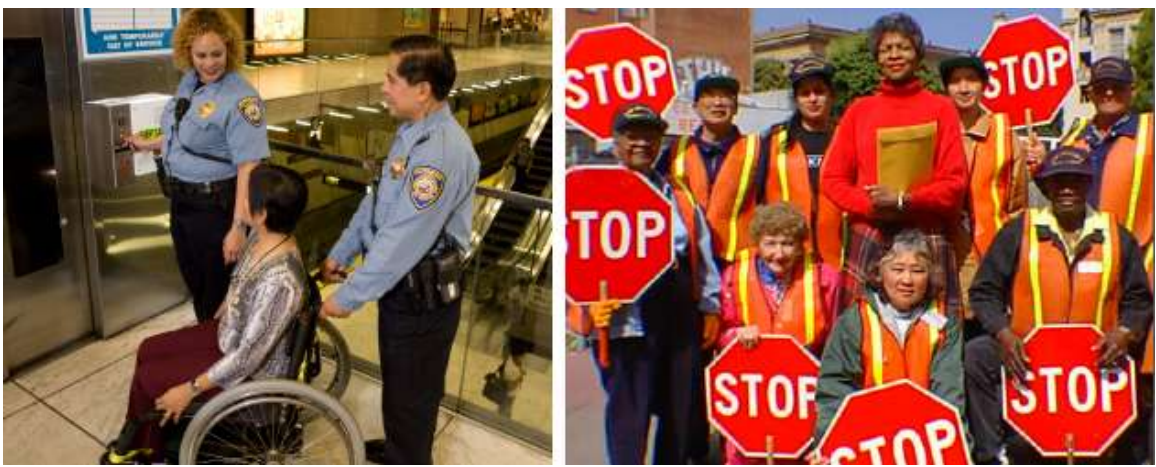
Left image: group using the elevators to access the Muni subway platforms Right image: a group of crossing guards with signs