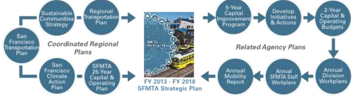
Figure 1: Relationship between the FY 2013- FY 2018 SFMTA Strategic Plan with other regional and SFMTA plans

In addition to the regional plans, the San Francisco County Transportation Authority (SFCTA) is the designated congestion management agency for the city and, in coordination with the SFMTA, develops the 25-year long-range transportation plan for the city and county. The SFMTA and SFCTA are collaborating on the development of the San Francisco Transportation Plan, drawing heavily from regional planning efforts, demographic projections and local long-term land use development plans. Lastly, the Agency develops internal multimodal and modal mid- and long-range plans for transportation capital and operational needs. The Capital Plan provides an unconstrained prioritization of capital needs and filters projects based on performance criteria. The five-year Capital Improvement Program includes those multimodal capital needs that can be delivered in that funding timeframe.