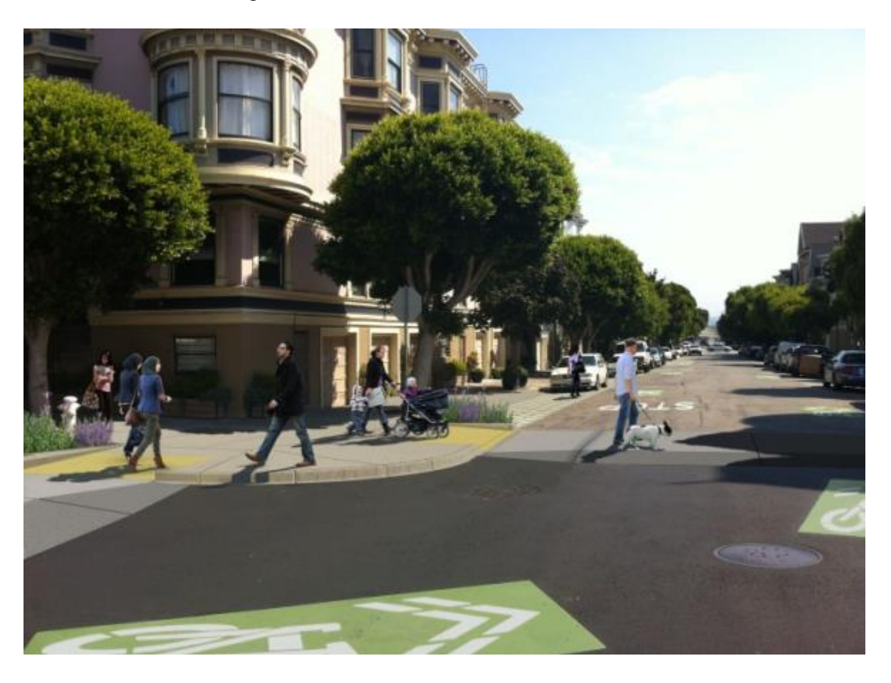
Rendering of Bulbout with Rain Garden at Pierce and Waller