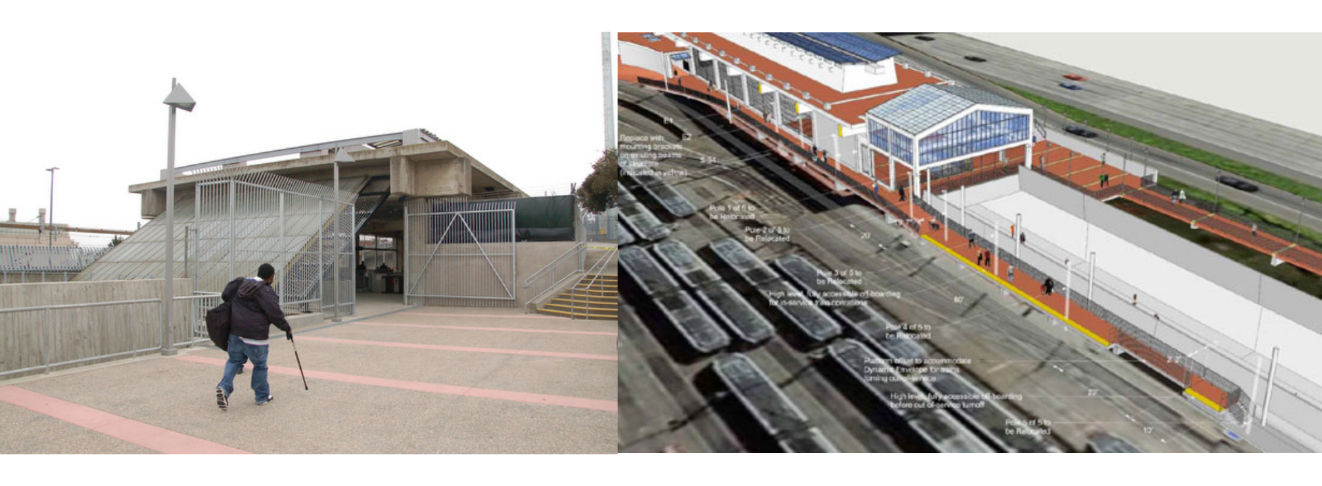
Phase 2 – Eastside Connection