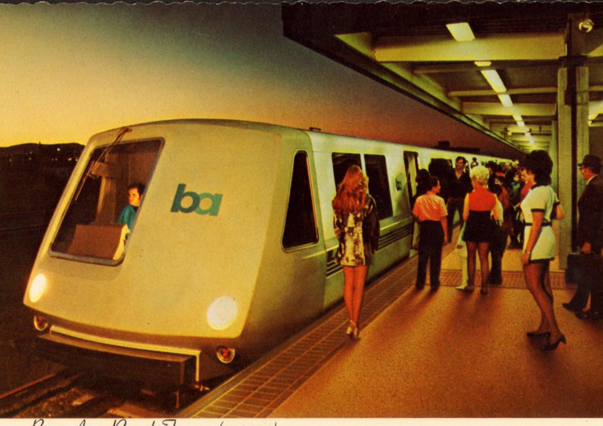
Bay Area Rapid Transit (BART)