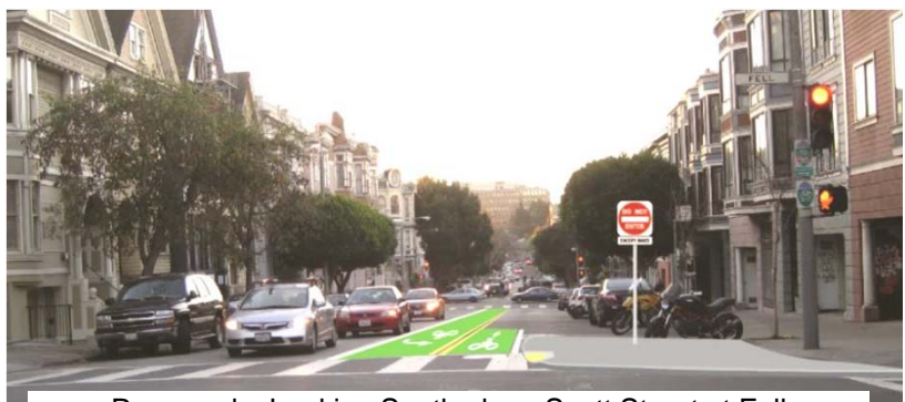
Proposed – Looking South along Scott Street at Fell

This location was originally identified by an application by neighbors for traffic calming on Scott Street, and was recommended for diversion to address collisions and congestion in response to priorities identified by several San Francisco plans including Vision Zero, the Green Connections Plan and the Bicycle Strategy.