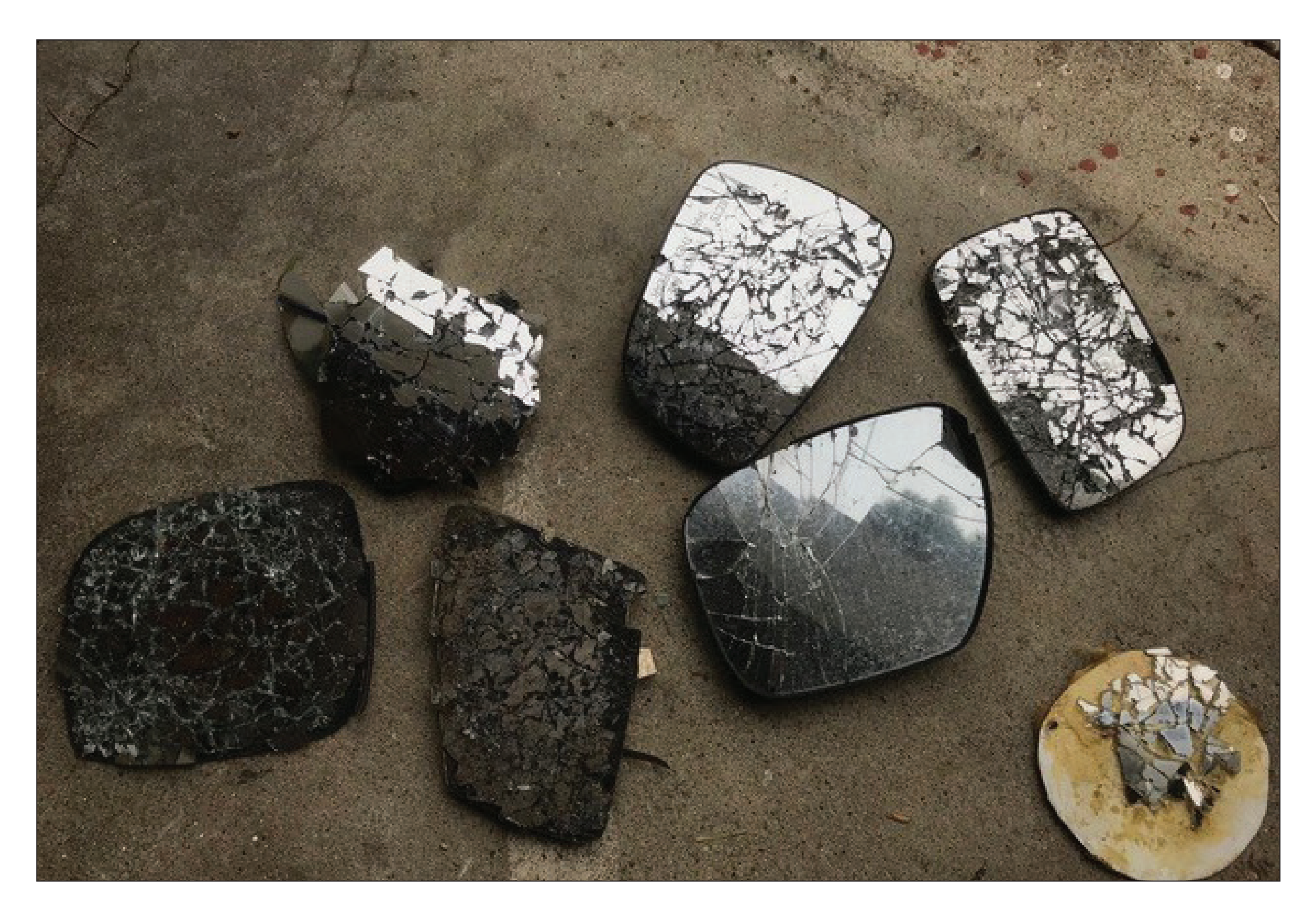
Narrow lanes lead to frequent collisions. This is a sample of mirrors knocked off of parked vehicles on California Street.

Lanes are too narrow for Muni buses and other wide vehicles. Multiple lanes of traffic contribute to speeding and collisions.