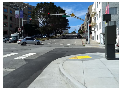
Pedestrian bulbs help make people walking more visible to cars and shorten crossing distances.

Utility work started at Masonic Avenue and is moving east along Geary towards Van Ness Avenue. Sewer, water and fiber optic conduit installation is expected to take about 2-3 months per block. After new water mains have been installed, water service to some properties may be briefly shut off while SFPUC connects to the new water main. SFPUC will coordinate with businesses and send out water shut-off notices in advance.