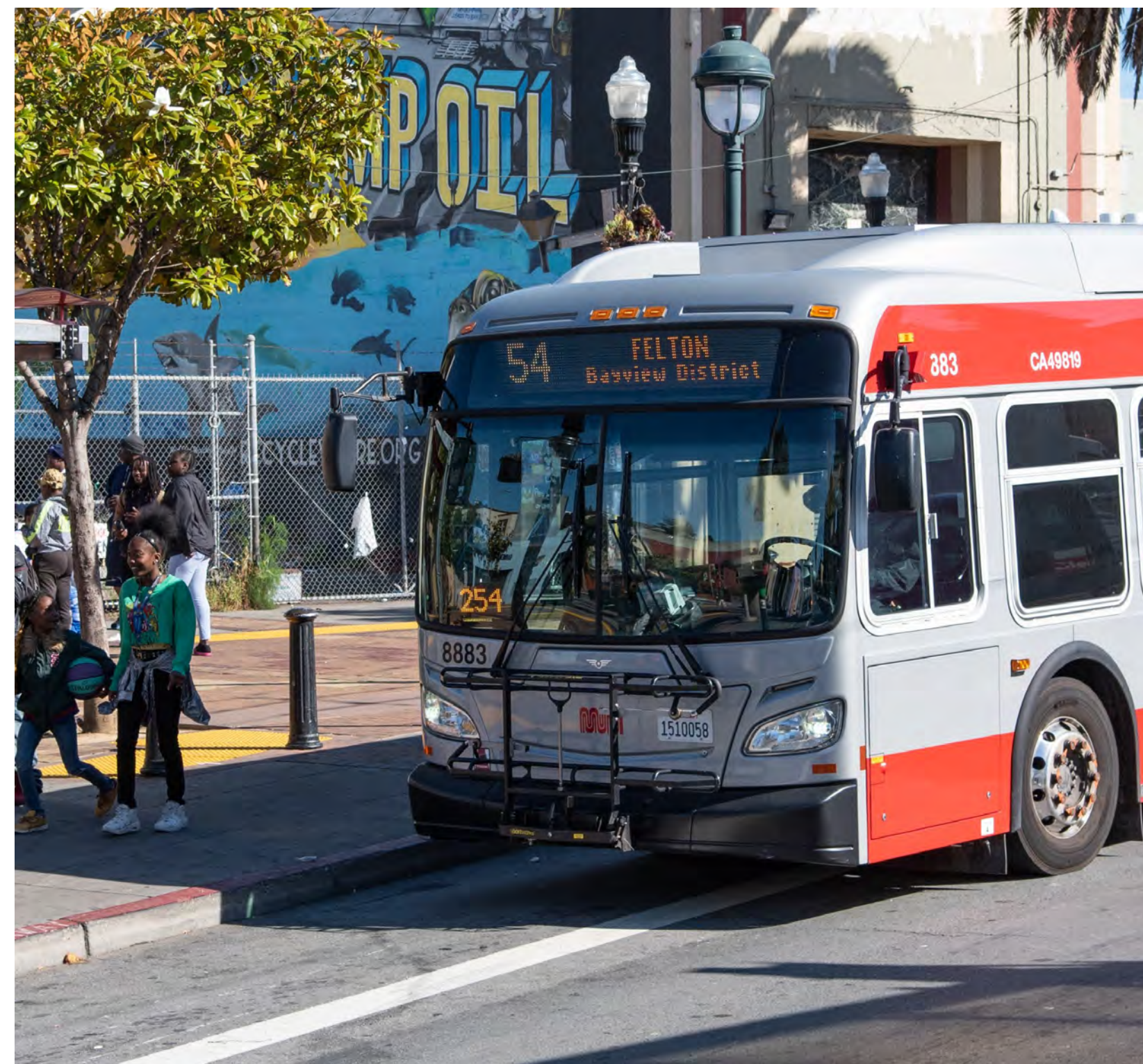
54 Felton at 3rd Street