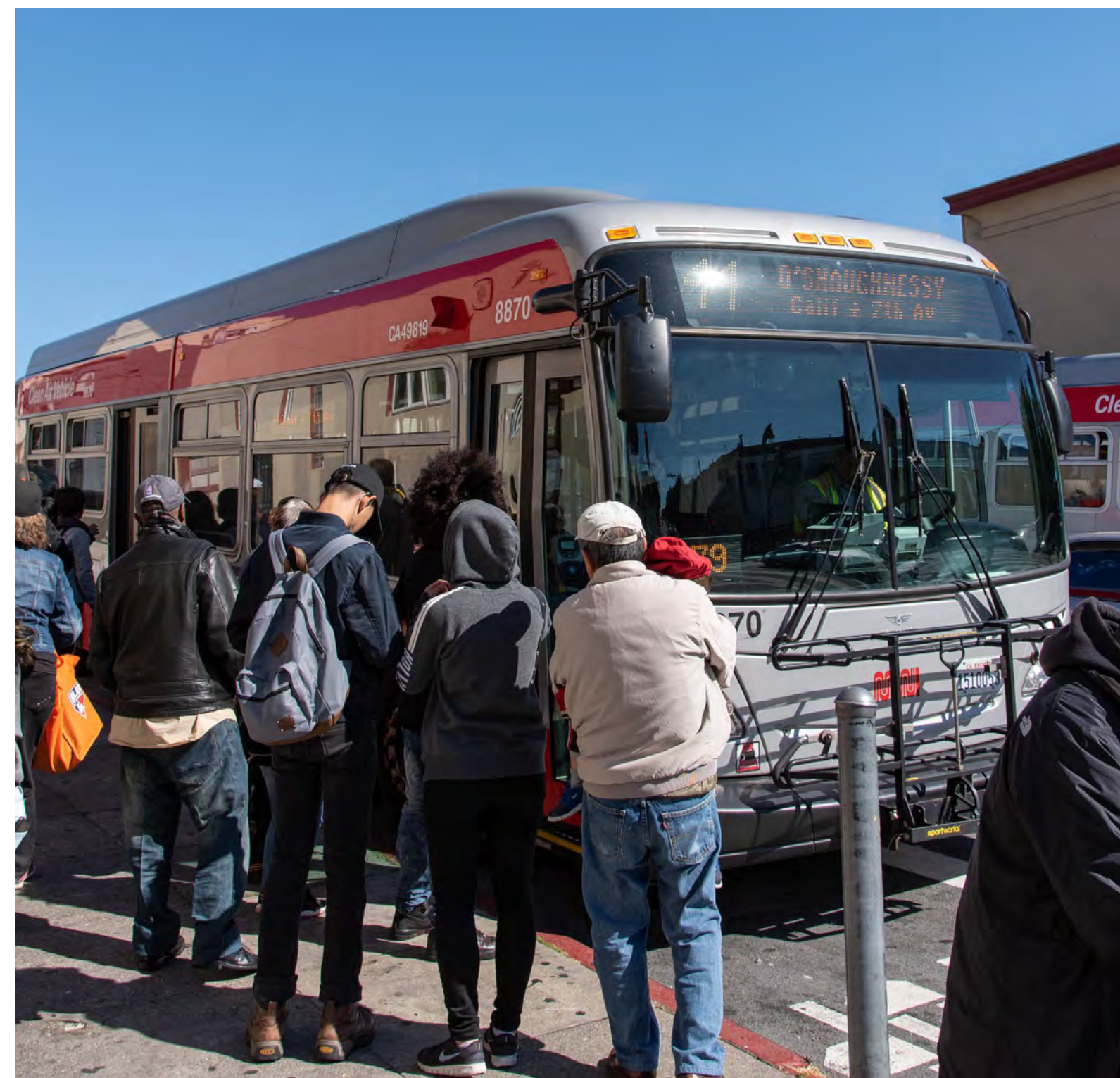
43 Masonic on Lombard Street