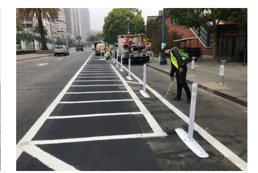
Rincon Restaurant Zone Quick Build: This project established a protected bikeway for norhtbound bicyclists and expanded capacity for commercial and passenger loading.