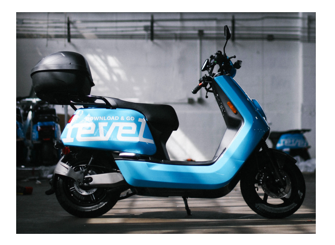
Revel electric moped

The permit applies to all RPP areas citywide, equivalent to a standard RPP permit.