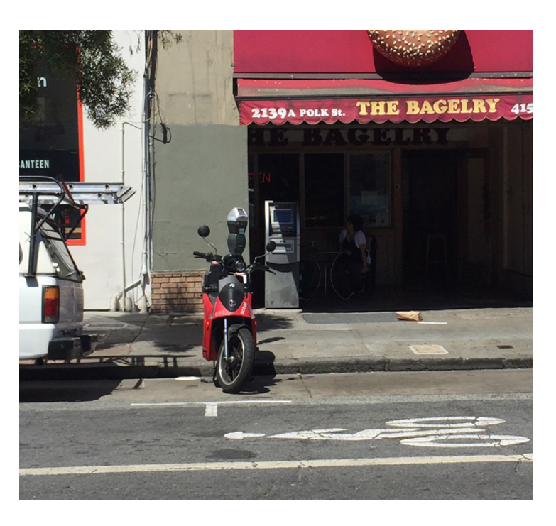
Electric moped parked at end of a full-size metered parallel stall

For Revel moped parking or operating issues, please contact Revel Operations at 347-922-5481 or <a href="mailto:opsmgmt.bayarea@gorevel.com">opsmgmt.bayarea@gorevel.com</a>.