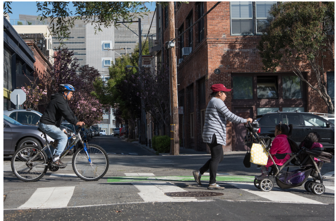
Folsom at Sherman street

San Francisco's 2018 Central SoMa Plan approved an additional 16M square feet of space for new transit-oriented housing and jobs over the next 25 years. The Folsom Streetscape Project is a central component of