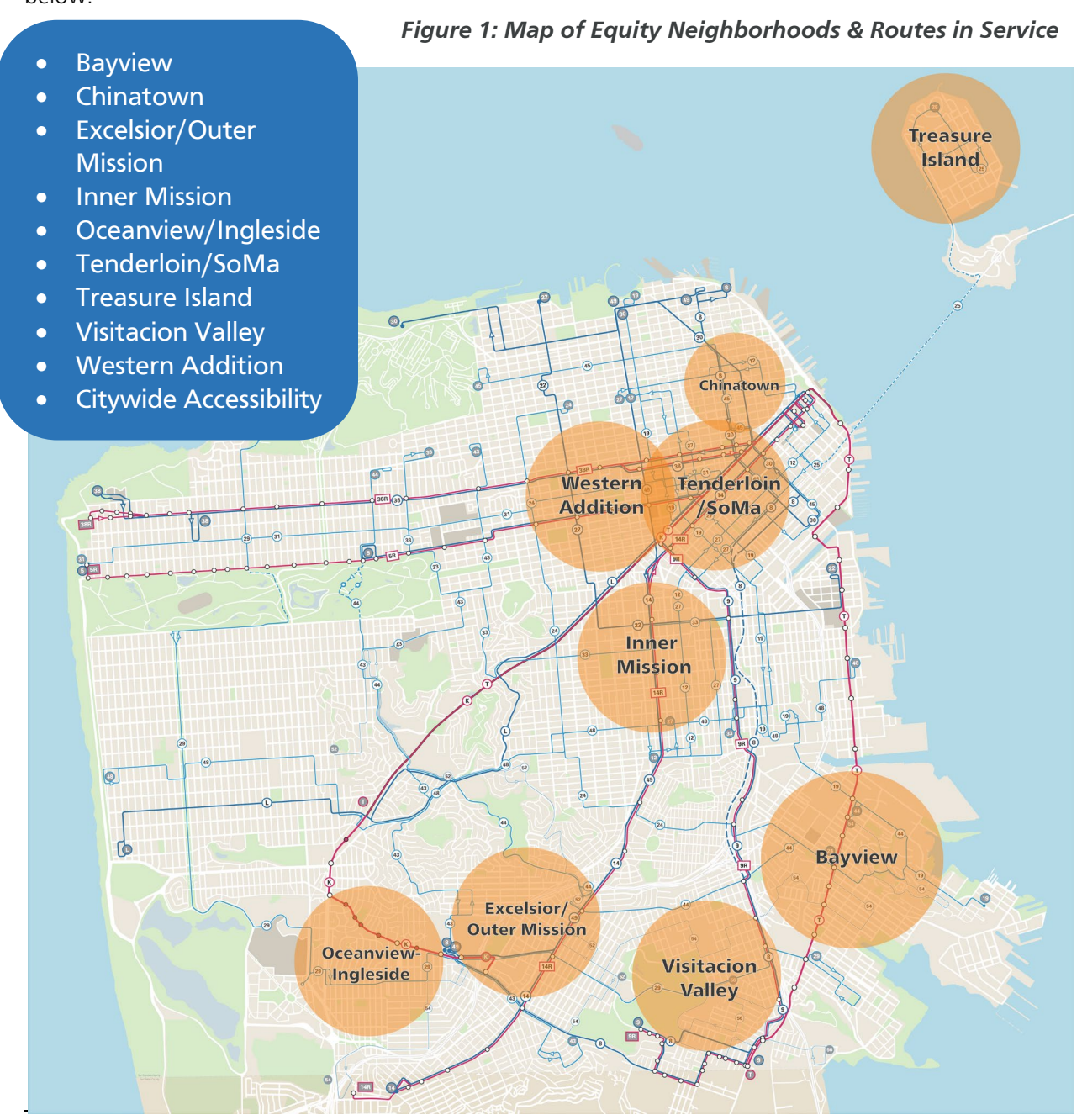
<sup>1</sup> San Francisco Municipal Transportation Agency. April 2016. Muni Service Equity Strategy Report: Fiscal Year 2016-17 and 2017-18. Retrieved from <a href="https://www.sfmta.com/sites/default/files/agendaitems/2016/4-5-16">https://www.sfmta.com/sites/default/files/agendaitems/2016/4-5-16</a> Item 13 Muni Equity Strategy Report 1.pdf

The current neighborhoods and routes identified by the Muni Equity Strategy are listed and shown below: