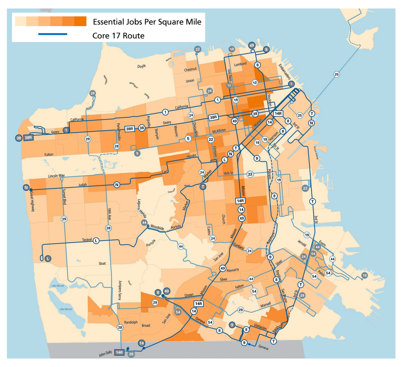
Figure 3 Concentration of Essential Jobs & Core 17 Routes