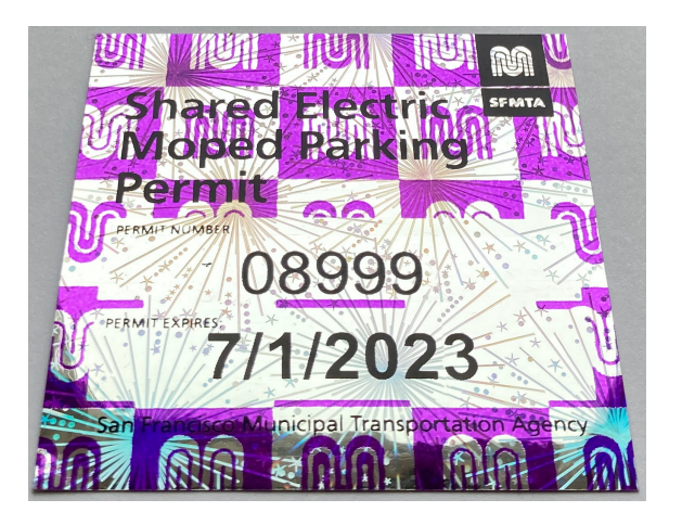
Shared Electric Moped Parking Permit (3-inch square sticker, purple on silver)

At present, mopeds operated by Revel Transit are eligible for the permit. See illustration above for typical Revel moped (always blue, always bearing "Revel" name prominently).