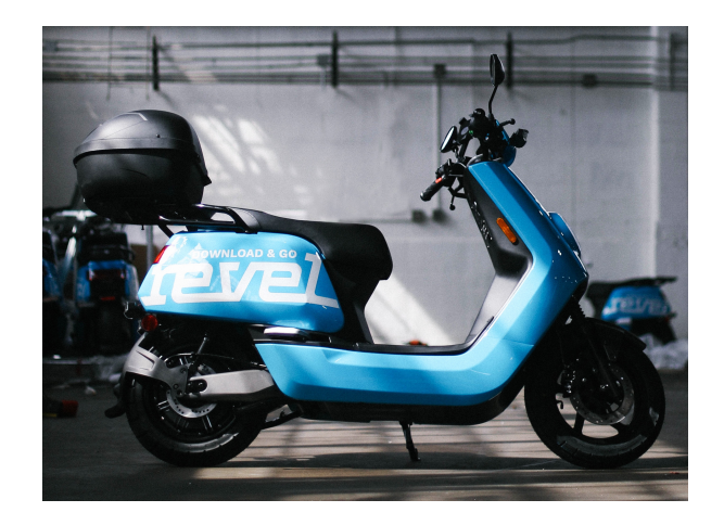
Revel electric moped