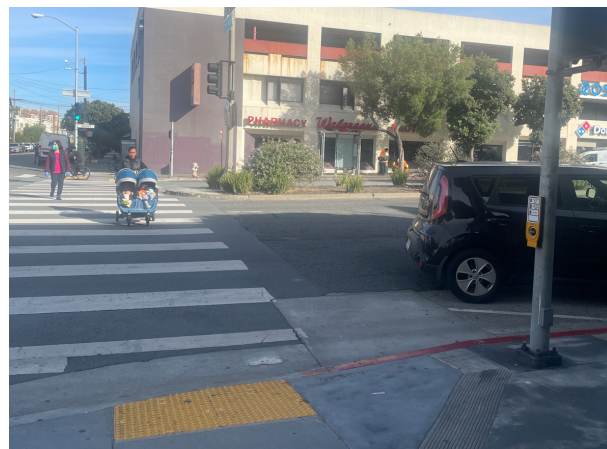
Crossing Geary Boulevard at 17 th Avenue

The Geary Boulevard Improvement Project is the second phase of work, aiming to extend those benefits to the western part of the corridor between Stanyan Street and 34th Avenue in the Richmond by improving Muni's 38 Geary bus service and addressing traffic safety. SFMTA conducted two rounds of outreach in 2021 and 2022 to seek feedback from a variety of stakeholders, including those representing seniors and people with disabilities, to develop the detailed project design, which will be considered for approval in early 2023.