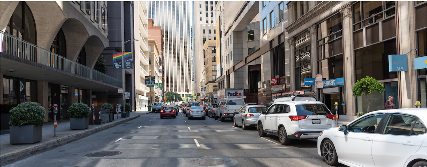
Before Quick-Build Improvements on Battery Street