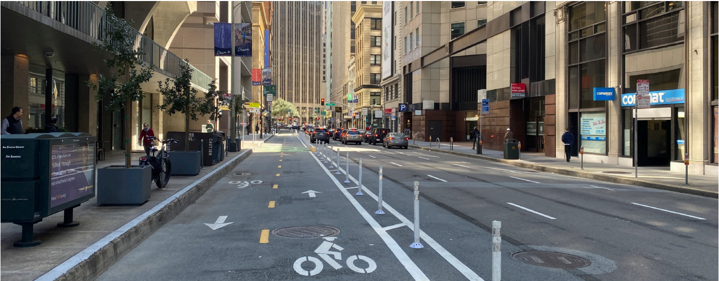
After Quick-Build Improvements on Battery Street