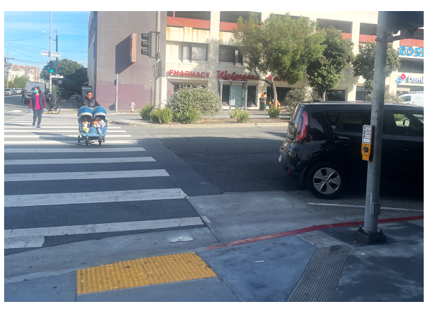
Crossing Geary Boulevard at 17th Avenue

The <u>Geary Boulevard Improvement Project</u> is the second phase of work, aiming to extend those benefits to the western part of the corridor between