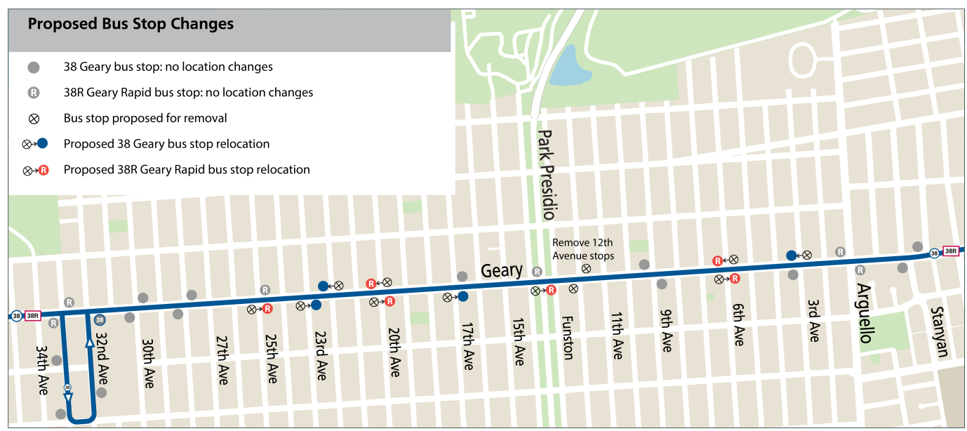
Map shows 38 and 38R Geary bus stops and proposed changes.

The Geary Boulevard Improvement Project proposes several bus stop changes as shown in the map below. If approved, most of these changes would be implemented in late 2023. One change, which is moving the outbound bus stop at 6<sup>th</sup> Avenue to the west side of the intersection, would occur at a later date.