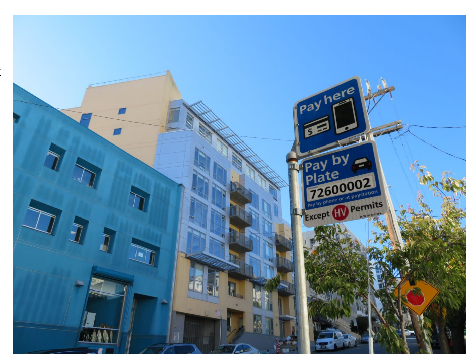
A sign for Pay or Permit Parking in Hayes Valley

The two-hour time limit that governs most RPP spaces generally discourages all-day parking by nonresidents. However, its enforcement is much more difficult than enforcement of metered parking, as it requires two passes (one to mark the car, and another more than two hours later to actually issue the citation) as opposed to one for metered parking. This challenge for enforcement means more drivers may exceed the time limit without facing a citation. The time limit also makes things more difficult for visitors who may have a legitimate reason to stay longer while still following the rules, as it requires them to move their car every two hours – a cumbersome task for, for example, a plumber working on a major installation project.