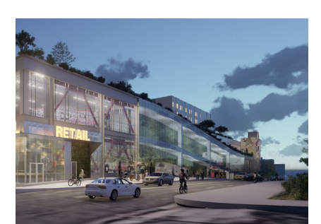
Streetscape of 17th Street that activates the street for pedestrian-uses with commercial opportunities, public art, and enhanced landscaping.

Potrero Neighborhood Collective welcomes feedback on the following items: