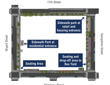
Trees and Landscaping to create a more enjoyable pedestrian experience.