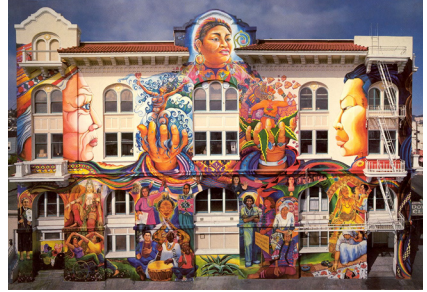
Public Art as a means to capture the essence of the neighborhood. Two percent (2%) of bus yard construction costs will fund public art at Potrero Yard.