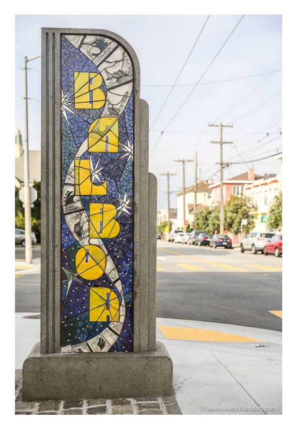
Example gateway treatment on Balboa Street