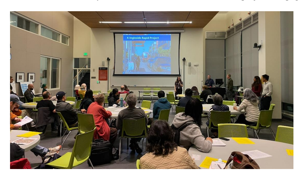
Figure 9: Project staff presented about the project at an open house at City College.

Following the summer 2023 round of outreach, we continued design and engineering and began to share updated proposals with the community, by holding a joint open-house and tabling event at City College with the Frida Kahlo Quick-Build Project, offering a briefing to members of the Ocean Avenue Mobility Action Plan Task Force, and via the project webpage and mailing list.