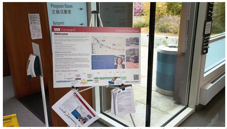
Figure 8: A three-week multilingual display at the Ingleside Branch Library offered one way for community members to learn about the project and complete a community survey.

In the summer, we launched a project survey. We promoted awareness of the project and the survey with a multilingual postcard mailed to all residents and businesses near Ocean Avenue, multilingual posters along the corridor, email and text message alerts to all project and K Ingleside alert subscribers and a three-week drop-in, self-guided open house hosted at the Ingleside Branch Library. We hosted pop-ups outside popular locations like Ming Kee Restaurant and Win Long Ocean Hardware, City College and 24 Hour Fitness, with interpretation and translated materials.