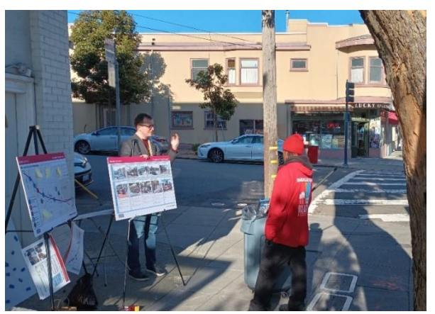
Figure 7: Left: Outside of Aptos Middle School, we heard feedback from students and riders. Right: At a pop-up outside North East Medical Services, we heard feedback on the project from community members, including this Ocean Avenue CBD Community Ambassador.

Awareness of the project was boosted by articles in outlets including the SF Examiner, Ingleside Light and SF Streetsblog. We received over 150 pieces of feedback and heard general support for concepts like transit lanes, upgrading boarding islands to allow for two-car service, and traffic safety improvements.