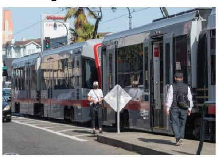
Traffic congestion delays transit