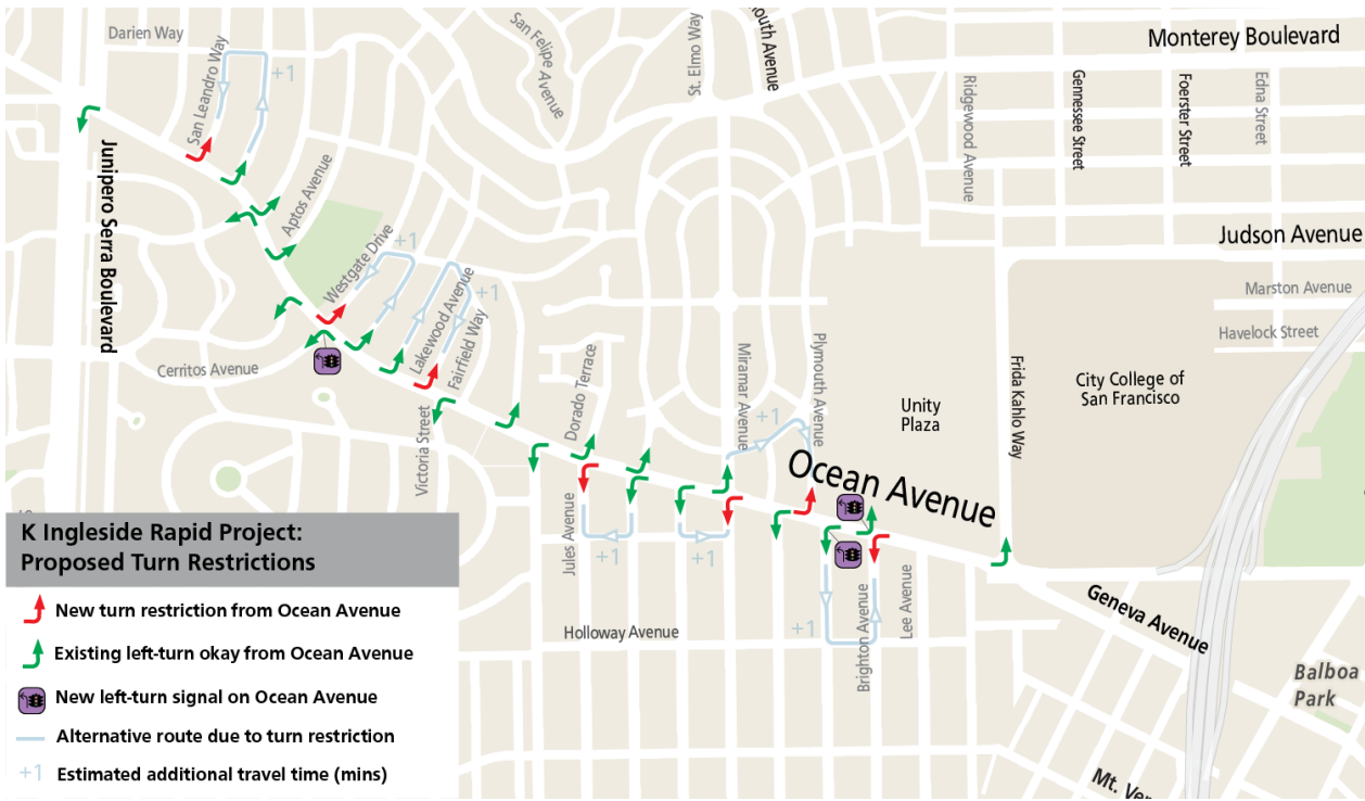
Figure 4: Locations of proposed turn restrictions and turn signals on Ocean Avenue.

5. Pedestrian safety measures: The project would add corner sidewalk extensions ("pedestrian bulbs") at four intersections on Ocean Avenue, at San Benito Avenue, Westgate Drive/Cerritos Avenue, Manor Drive and Granada Avenue, to increase the visibility of people walking, slow turning vehicles and reduce the distance and amount of time it takes to walk across the street. To improve visibility of pedestrian crossings, flashing beacons would be added at the intersections of San Benito Avenue, Manor Drive, and Granada Avenue. The crosswalks at San Benito Avenue, Granada Avenue, and Plymouth Avenue would be consolidated or relocated to direct people walking to safer crossing locations that do not conflict with turning movements, while a right turn only restriction for drivers coming from Granada Avenue and southbound Plymouth Avenue would further reduce turning conflicts. A STOP sign would be implemented at southbound Plymouth Avenue, replacing the existing signal, to accommodate the new left turn phase on westbound Ocean Avenue at Plymouth Avenue.