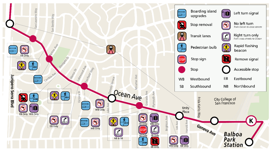
Figure 3: Overview of proposed improvements

To address the challenges outlined above, the project proposes the following improvements (illustrated in Figure 3).