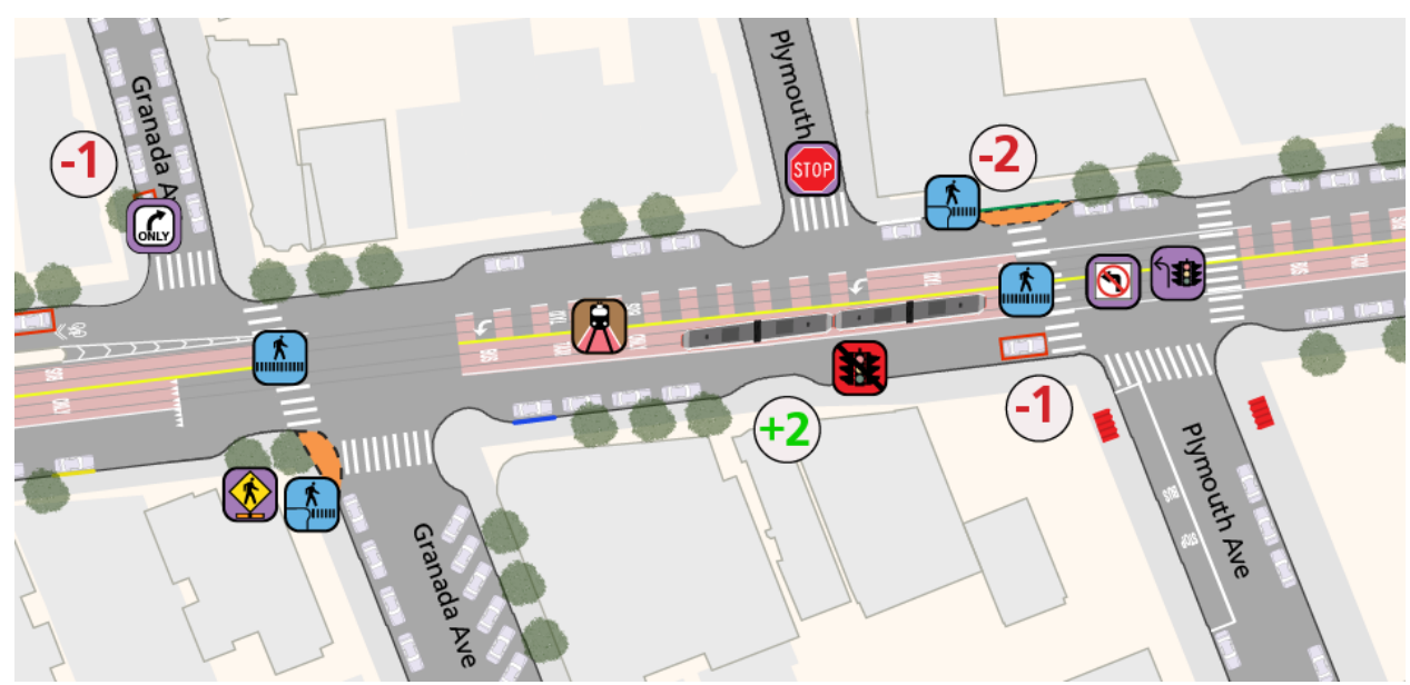
Figure 5: Safety treatments proposed on Ocean Avenue at Plymouth and Granada avenues