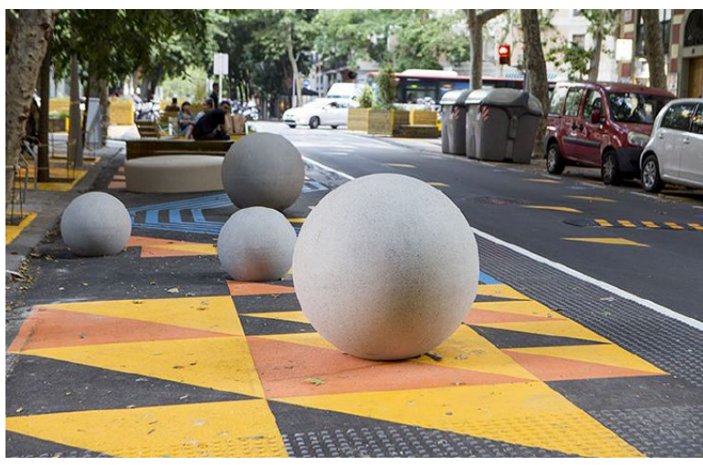
Examples of materials that could be placed at bus stop and near Ulloa/Lenox intersection