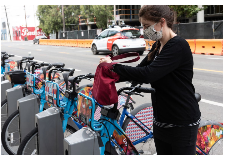
Examples of materials that could be placed at station entrance