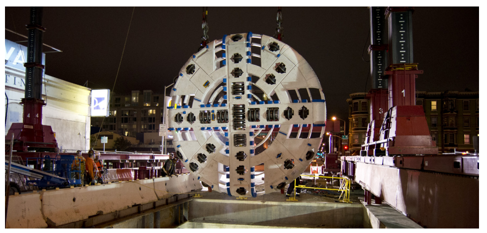
Lowering TBM Big Alma's cutterhead into the launch box