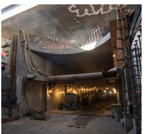
Construction of the tunnel portal