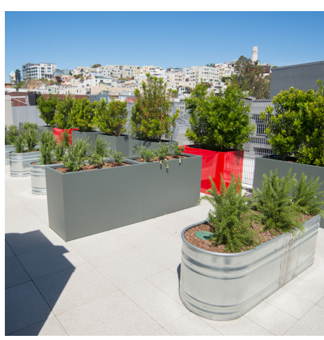
Newly-constructed Broadway-Sansome Apartments consists of 75 units, support services, ground floor retail and a roof garden