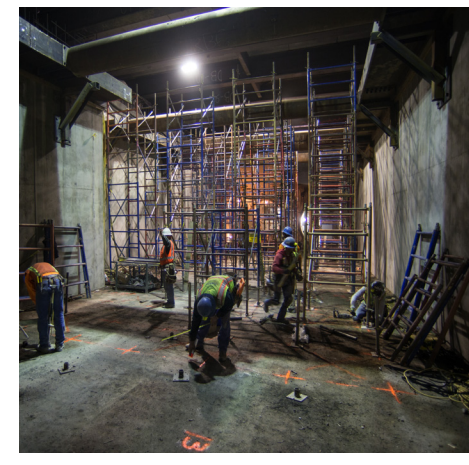
Construction of the tunnel portal