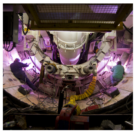
Assembly of TBM Mom Chung