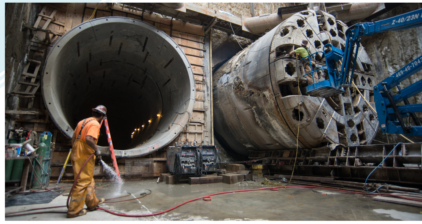
he bottom of the former North Beach retrieval shaft, TBM Mom Chung can be seen being removed from the southbound tunnel while a worker keeps the site clean.