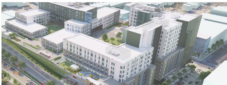
Aerial view from the northwest shows the Preferred Project with the bus facility and proposed housing (Arcadis)