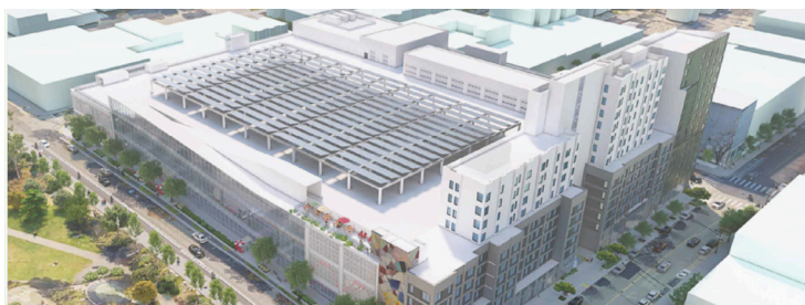
Aerial view from the northwest shows the Paratransit Variant with paratransit operations above the bus facility (Arcadis)