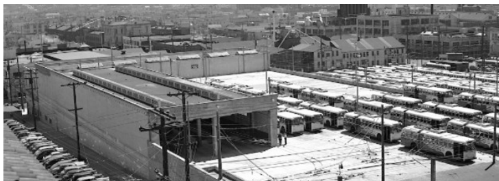
View southwest on Hampshire and 17th streets toward Potrero Division Bus Yard | July 7, 1949